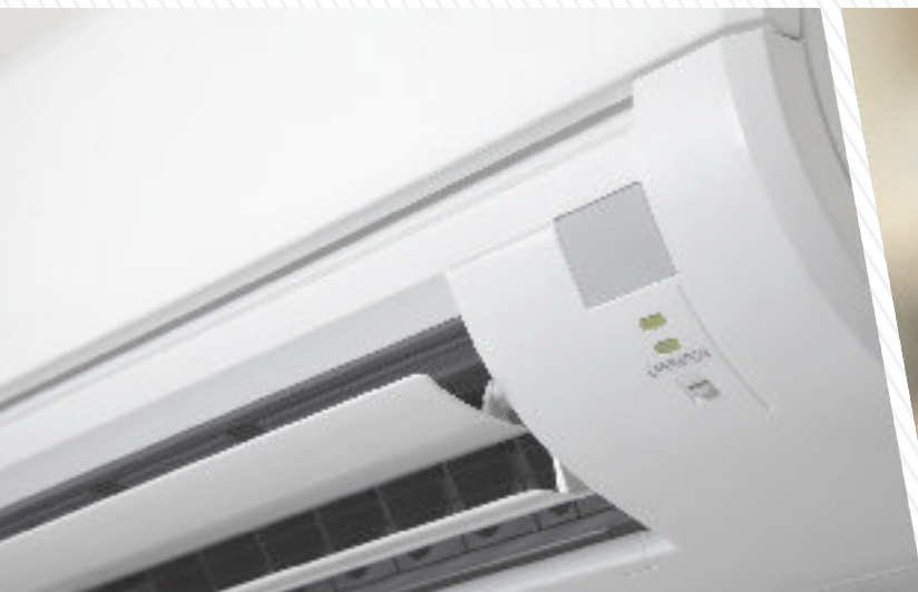
Split Air-conditioning, Video Door Phone