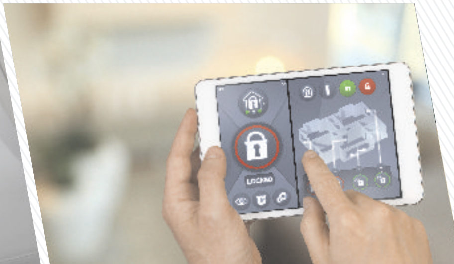
i Pad controlled smart home concept. (This feature is optional and can be opted by customer at additional cost)