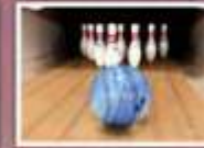
Family Entertainment Centre